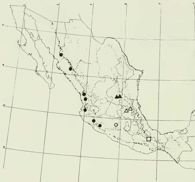
Figure 3. Distribution of Stachys species: S. jaimehintonii (open circle); S. albotomentosa (open triangles var. albotomentosa ; closed triangles var. potosina ); S. pacifica (closed circles); and S. torresii (open squares).